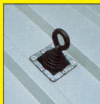
THE ANCHOR ON A METAL CLAD ROOF