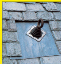
THE ANCHOR ON A SLATED ROOF